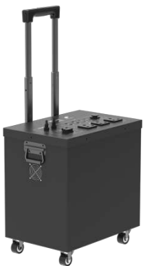
Model No. HS1520