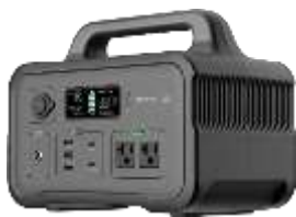
Model No. HS600