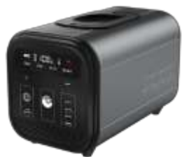
Model No. HS302