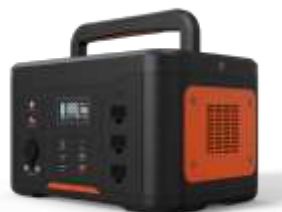
Model No. HS1001