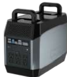
Model No. HS1500