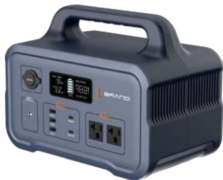
深蓝色 Dark blue