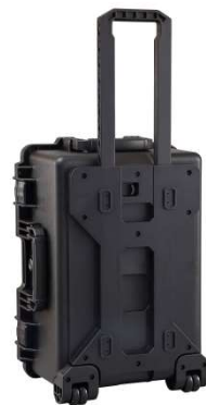
Model No. HS5000