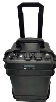
Model No. HS3000