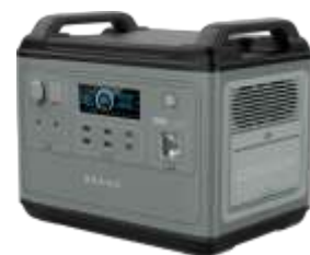
Model No. HS2000