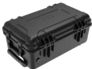
Model No. HS2400