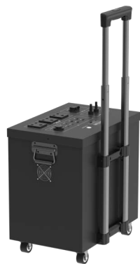
Model No. HS2500