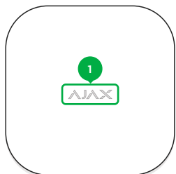
1 - Logo with a light indicator.