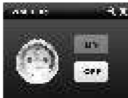
Fig. 1 Wall Plug icon in Home Center 2 interface

After successful inclusion Plug will be represented in the Home Center 2 by the following, single icon: